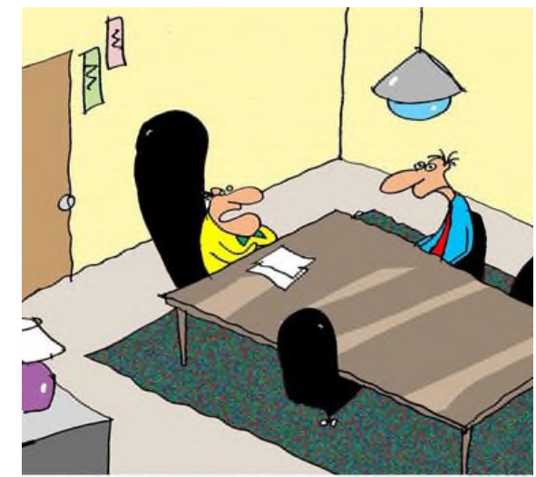
"We finally figured out how to get the upper hand on our competition: we want you to go work for them."

The company demurred on the ground that the claims were preempted by Fed/OSHA because a state prosecutor's pursuit of civil penalties