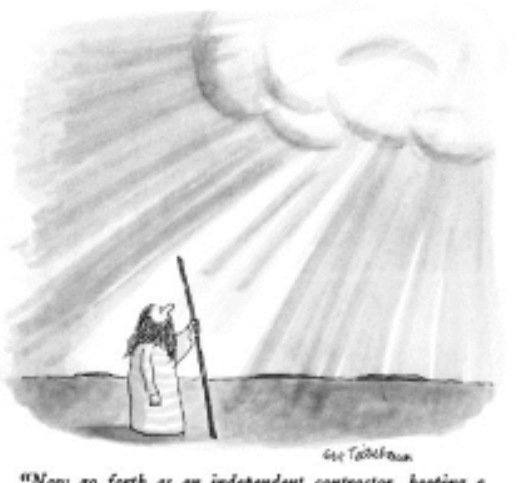
"Now go forth as an independent contractor, keeping a coreful diary of your travel expenses."

More than 2;000 delivery drivers for FedEx filed a class action lawsuit in state court alleging claims for